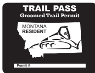
Resident Trail Pass